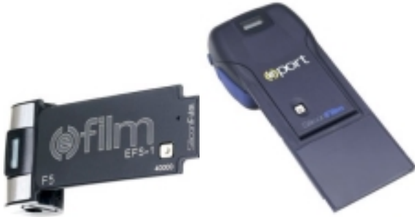
Figure 1. EFS-1 components: (e)film and (e)port

In addition, the functional requirements of minimal impact and interference with camera operation implies that the (e)film cartridge should operate from a dedicated power source rather than use the batteries of the 35mm camera body. The (e)film power, therefore, is supplied by a pair of 1/3N batteries stacked within the film canister. The 1/3N batteries are the smallest size batteries readily available and consistent with the (e)film power requirements. Even these small form factor batteries occupy most of the available volume in the film canister section. As a result, the circuit board containing the electronic components necessary for image capture, storage, processing and control are contained on a rigid/flex PCB assembly that is wrapped and folded around the (e)film battery compartment and represents some fairly creative circuit board design and layout as well as clever mechanical engineering of the (e)film cartridge. A functional block diagram of the EFS (e)film/(e)port is shown in Figure 2.