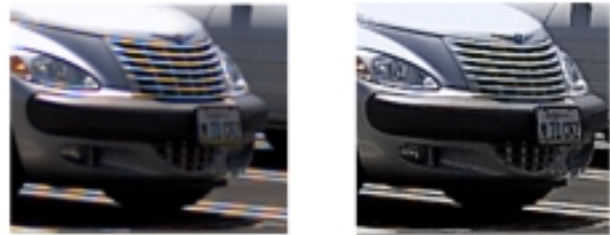
aliasing and sharpening enabled

The absence of a blur filter in this system produces a beneficial side-effect with respect to image quality. In digital camera systems using anti-aliasing filters, there is a well known tradeoff between image sharpness and aliasing artifacts 6 . Furthermore, an improperly designed combination of image sensor pixel size and blur filter spot Figure 4.- Left image: anti-aliasing & sharpening disabled; Right image: anti-